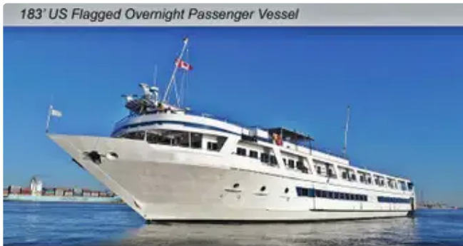
183' US Flagged Overnight Passenger Vessel